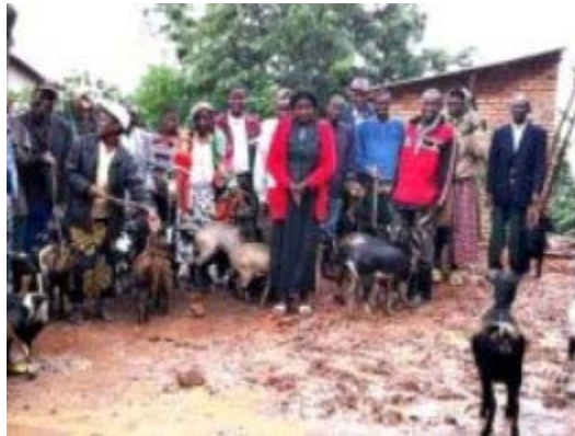
A portion of the 40 goats sent by EAF congregations to the reconciliation cooperative.